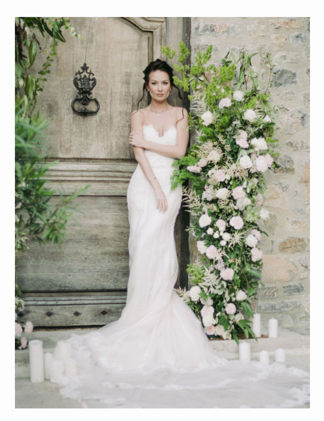
Price of the service on request

The price may vary depending on the number of days of organization (welcome dinner, brunch...), and I propose to discuss this with you over coffee or via video if you are not located in the region.