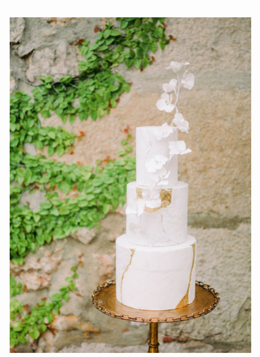
Price of the service on request